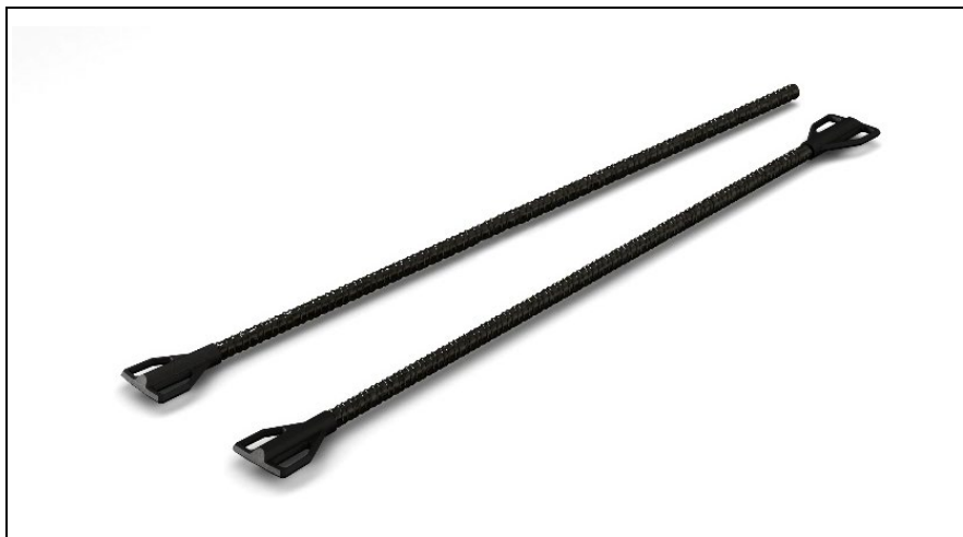
Figure 1 Teplo BF and BFR Wall Ties

(1) Type classification as defined in PD 6697 : 2019.