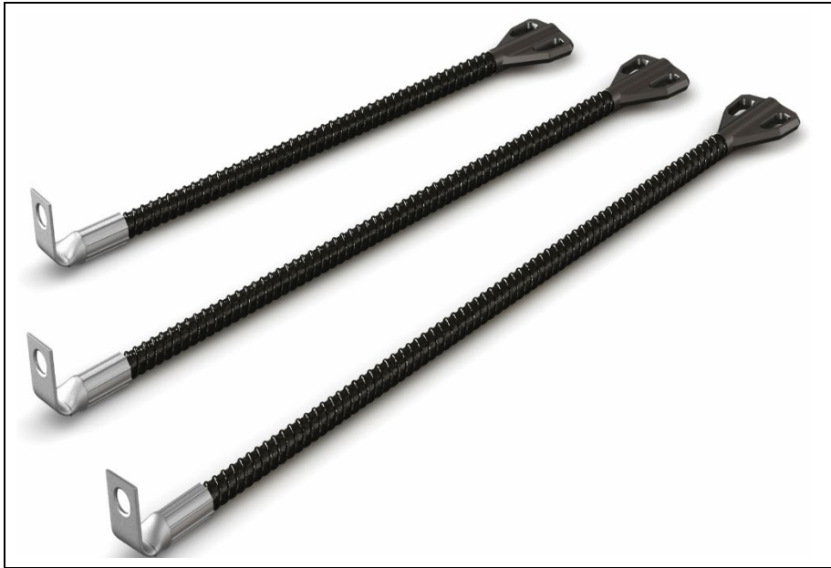
Figure 1 Teplo BFL Wall Ties